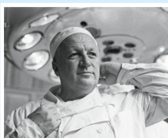
Academician Boris Petrovsky

Denis Manturov, Minister of Industry and Trade of the Russian Federation