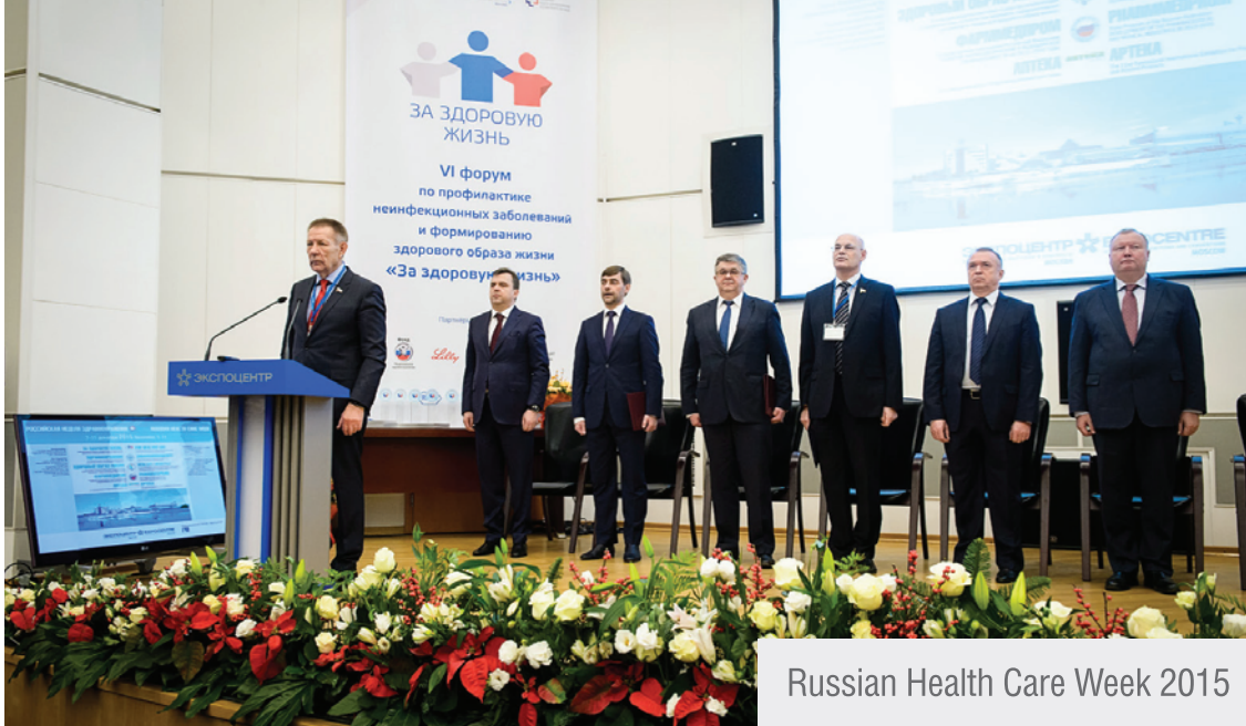
Russian Health Care Week 2015